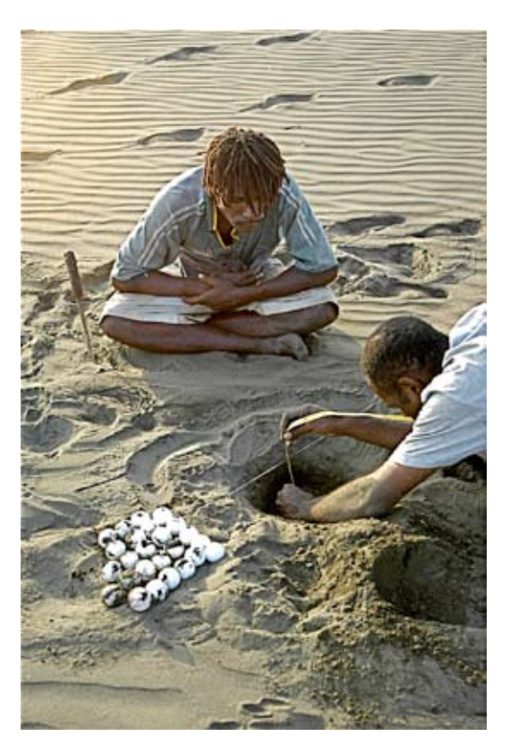
Figure 7. Carettochelys insculpta in Papua New Guinea nests on sand bars in the upper reaches of rivers, but also along the coast (as in this photo) where its nests are periodically inundated by the tides.

billabongs and plunge pools of the Alligator Rivers region (Legler 1980, 1982; Press 1986; Georges and Kennett 1989). The preferred dry season habitat in the Alligator Rivers region is typified by Barramundi Creek (Legler 1982) and Pul Pul Billabong (Georges and Kennett 1989). Average depth was approximately 2 m but there were holes between 3 and 7 m deep. The substratum was sand and gravel covered with a thin layer of fine silt and litter. Fallen trees and branches, undercut banks, exposed tree roots, and local accumulations of litter provided a diverse range of underwater cover for turtles. The banks of the billabongs