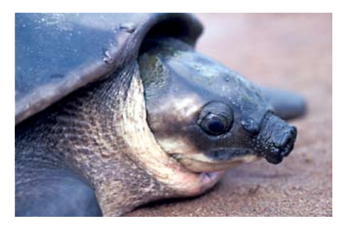
Figure 3. Adult female Carettochelys insculpta , Daly River, Northern Territory, Australia.