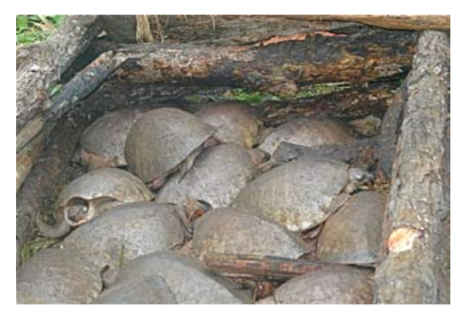
Figure 8. Stereotyped nesting habits render Carettochelys (like sea turtles) extremely susceptible to over-exploitation. Shown here are 24 adult nesting turtles harvested immediately after high tide on one night on one coastal beach in Papua New Guinea in 2007. The animals were flipped on their backs by the hunter who returned later to collect them and return them to camp where they were held in a makeshift enclosure until slaughter. The meat fed many families.

There are few data on levels of exploitation in Australia. Georges and Kennett (1988) reported an annual harvest of 19 turtles by two Aboriginal families at Nourlangie Camp, and the Wagiman Aboriginal people record their dry season harvest of turtles from the Daly River