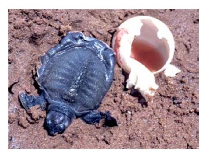
Figure 4. Hatchling Carettochelys insculpta from the Daly River, Northern Territory, Australia.