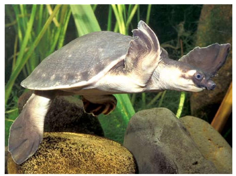
Figure 1. Subadult female Carettochelys insculpta, Daly River, Northern Territory, Australia.

included it among the suborder of side-necked turtles, the Pleurodira. He made this latter decision with some reference to morphological characters, but primarily because at the time, only side-necked turtles were known from Australia and New Guinea. Baur (1891a, b) was opposed to grouping Carettochelys with the side-necked turtles, and called upon Ramsay to release details of the articulation of the cervical vertebrae "to show at once the affinities of this peculiar genus." Unfortunately, the specimen lacked key anatomical elements, the cervical vertebrae, so the matter remained one of considerable debate (Ogilby 1890; Strauch 1890; Vaillant 1894; Boulenger 1898; Gadow 1901; Hay 1908) until the work of Waite (1905) became widely known. He described a more complete specimen from the island of Kiwai at the mouth of the Fly River, and examination of the cervical vertebrae established that Carettochelys properly belongs in the suborder Cryptodira, not the sidenecked Pleurodira.