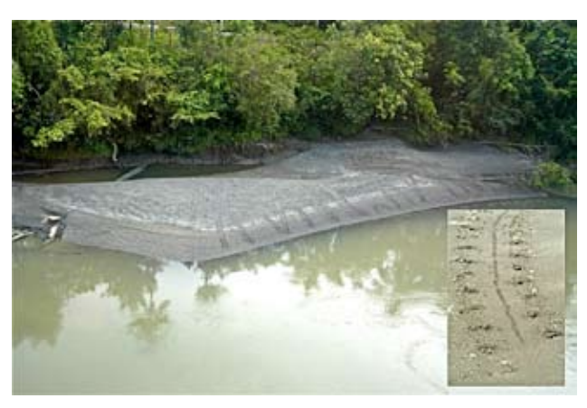
Figure 6. A typical riverine nesting beach for Carettochelys insculpta , Kikori River, Papua New Guinea The distinctive tracks are clearly visible from helicopter.

billabongs and plunge pools of the Alligator Rivers region (Legler 1980, 1982; Press 1986; Georges and Kennett 1989). The preferred dry season habitat in the Alligator Rivers region is typified by Barramundi Creek (Legler 1982) and Pul Pul Billabong (Georges and Kennett 1989). Average depth was approximately 2 m but there were holes between 3 and 7 m deep. The substratum was sand and gravel covered with a thin layer of fine silt and litter. Fallen trees and branches, undercut banks, exposed tree roots, and local accumulations of litter provided a diverse range of underwater cover for turtles. The banks of the billabongs