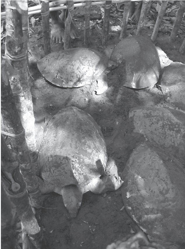
Fig. 4. Pig-nosed turtles ( Carettochelys insculpta ) captured in the Kikori region are often held in cages constructed beneath houses awaiting slaughter or sale.

The frequency with which turtles are harvested and the large size of Carettochelys and Pelochelys indicate that turtles are an important source of protein to complement agricultural produce, together with pig ( Sus scrofa and Sus celebensis ), fish, crabs, monitor lizards, cuscus, cassowary ( Casuarius casuarius ) and waterfowl. Our study confirms that the female adults and eggs of Carettochelys insculpta are heavily harvested, and the question arises as to whether this level of harvest is sustainable. Many villages have cages for housing Carettochelys awaiting slaughter or sale (Fig. 4). Only three turtles were held in this way at the time of our visits. The near absence of turtle and turtle eggs from the markets, contrary to observations in other reports (Rose 1981; Rose et al. 1982; Georges and Rose 1993), may have resulted from the interruption of harvest activity in the 3 weeks before our arrival, when heavy continuous rain flooded the Kikori and covered all nesting banks in the delta and upstream reaches.