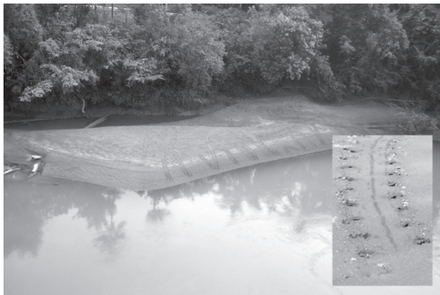
Fig. 3. A typical riverine nesting beach for Carettochelys insculpta . The tracks (inset) are readily distinguishable from those of other species and clearly visible from helicopter.

C Name provided by Martin Steer for Samoa Village (Kerewo), Aird Hills.