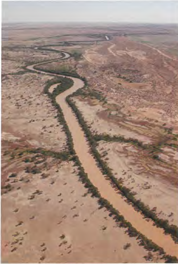
Fig. 5.3. Waterholes along Cooper Creek are deep and critically important aquatic habitat for turtles, which need to survive through prolonged dry periods. They form along the main channel during dry times. These waterholes are vulnerable to reductions in flows resulting from future water resource development.

Waterloo billabong on Noonbah Station). They were observed walking just in front of a flood on the floodplain of South Galway Station, near Windorah, far from the nearest permanent waterhole (Sandy Kidd, pers. comm.). The turtles probably know the landscape well, and use the floods to move between waterholes and floodplains where there is plentiful food. The food source then concentrates as the boom period ends and floodplains dry out and fish, crustaceans and insects concentrate in the waterholes where the only water remains. Cooper Creek turtles are giants of the turtle world in Australia (Fig. 5.1).