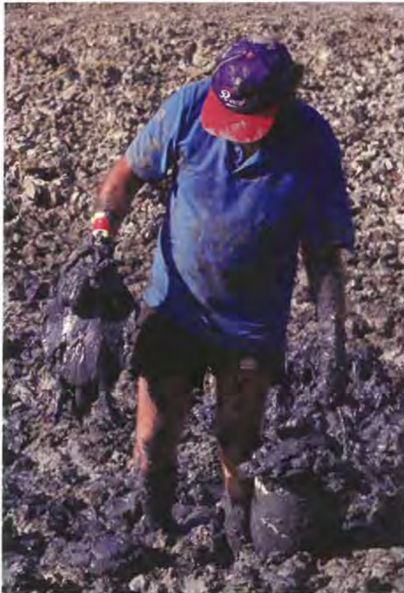
Fig. 5.4. During bust periods, turtles in Cooper Creek can die when waterholes dry up. Some individuals can survive briefly by seeking refuge in the mud, such as this Cooper Creek turtle from Lake Dunn, but they soon die.

The pressures of booms and busts and these life history tactics mean that populations of Cooper Creek turtles vary in a fascinating way, along the waterholes of Cooper Creek. Juveniles and adult males and females can be distinguished (Georges et al. 2006). The