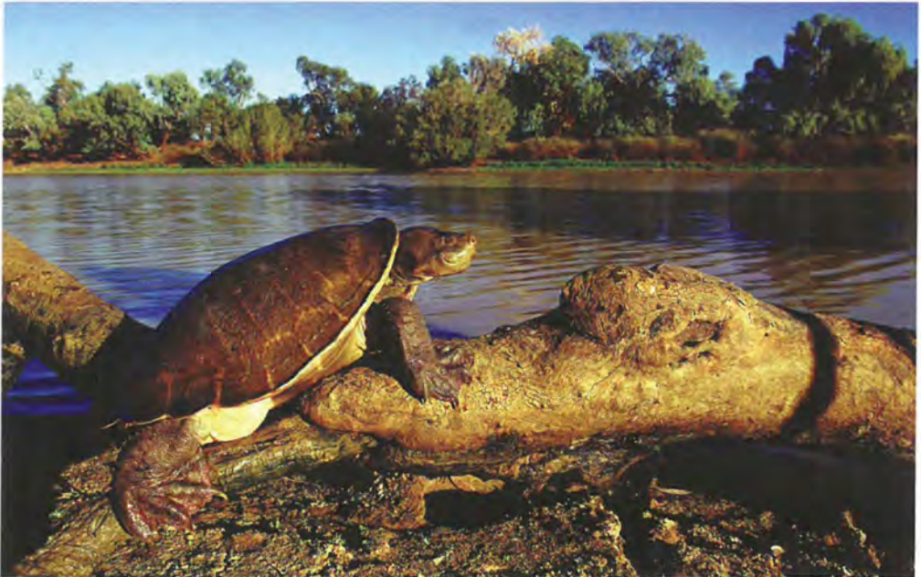
Fig. 5.1. The endemic Cooper Creek turtle is a giant of freshwater turtles and a top predator living mainly in the large waterholes of the Cooper Creek catchment.

Freshwater turtles in Australia are not only faced with a scarcity of water, compared to turtles in North America and Asia, but also the variability of when this water is available, given the considerable unpredictability in rainfall and resultant timing and magnitude of river flow and floodplain inundation. Turtles such as the Cooper Creek turtle ( Emydura macquarii emmottii ; Fig. 5.1), which survives in the driest part of our continent, cope in different ways with periodic drying and unpredictability, timing and duration of floods and dry periods.