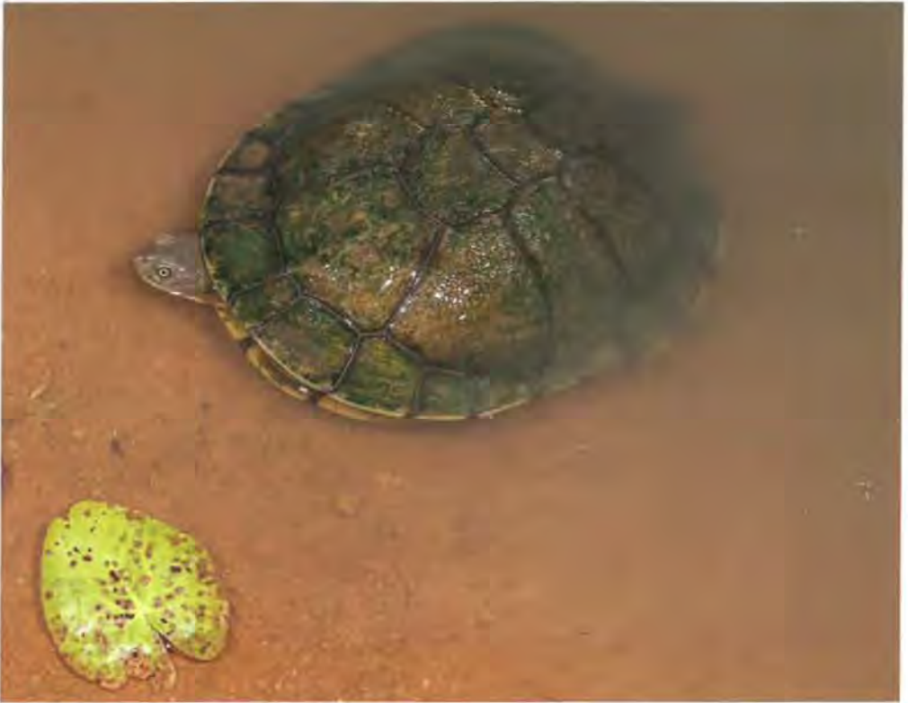
Fig. 5.2. Eastern long-necked turtles live in the upper reaches of the Lake Eyre Basin, favouring temporary waters and taking advantage of the production boom in invertebrate life when they fill.

Eastern long-necked turtles live in the Cooper catchment, but only as far south as Lake Dunn, near the town of Aramac. Further south along the Cooper becomes problematic for this species because of the long dry periods between flooding and the distances between waterholes which make overland migration difficult.