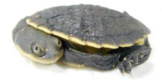
Figure 4. Chelodina expansa hatchling, seven days old, from Wentworth, New South Wales.

Description. — Chelodina expansa is one of Australia's largest chelids, though the species displays marked sexual dimorphism, with smaller males that mature earlier than females (Spencer 2002). Males are distinguished by an elongate tail that extends beyond the margin of the carapace when mature. Maximum adult female size can reach a