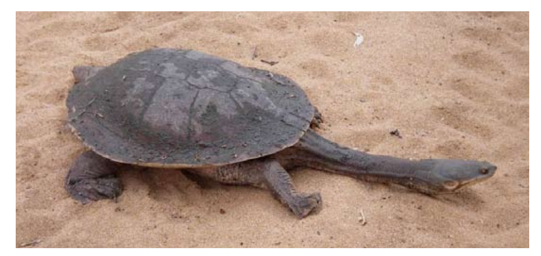
Figure 1. Gravid female Chelodina expansa negotiates a sandy dirt road in search of suitable nesting habitat, Paringa, South Australia, Australia.

group and is characterized by exceptionally long necks that have evolved independently of other South American long-necked genera (Georges et al. 1998). Chelodina species fall into three long-standing natural (monophyletic)