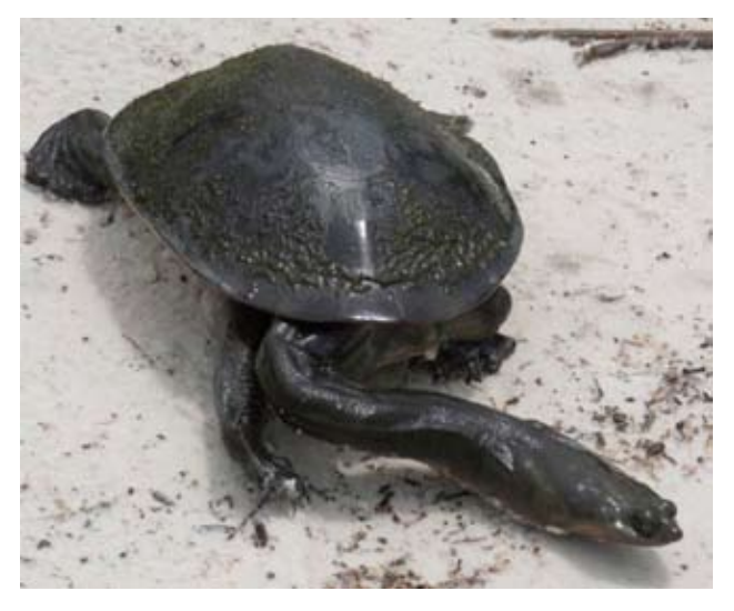
Figure 6. Sub-adult male Chelodina expansa , Lake Mackenzie, Fraser Island, Queensland. These insular animals are generally smaller and darker-colored than those in mainland populations.

Distribution. — Chelodina expansa is distributed throughout the inland rivers of southeastern Australia's Murray-Darling Basin. It is not known south of the Murray River proper, except for a population in the Goulburn River tributary (Cann 1998). Coastal populations occur in southeast