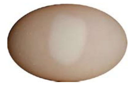
Figure 8. Chelodina expansa egg showing the white patch that occurs on the dorsal surface during early development.

temperature range from 4.9–29.6°C (Goode and Russell 1968), and the species likely exhibits genetic sex determination (GSD) similar to the other Chelids, such as C. longicollis (Ezaz et al. 2006) and Emydura macquarii (Martinez et al. 2008), though this has not yet been explicitly tested. Hatchlings measure 34.5–37.9 mm CL, with masses ranging from approximately 7.9–12.88 g (Booth 2000, 2002a); their size and mass are influenced by both the hydric environment of the nest and the clutch of origin (Booth 2002b).