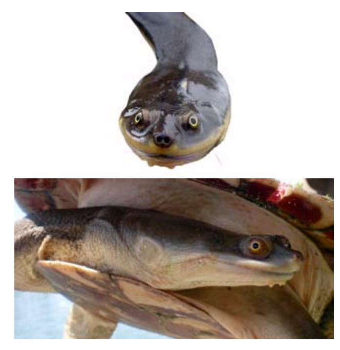
Figure 3. Front and side of Chelodina expansa head.

There are morphological differences between mainland C. expansa populations and those on Fraser Island (insular