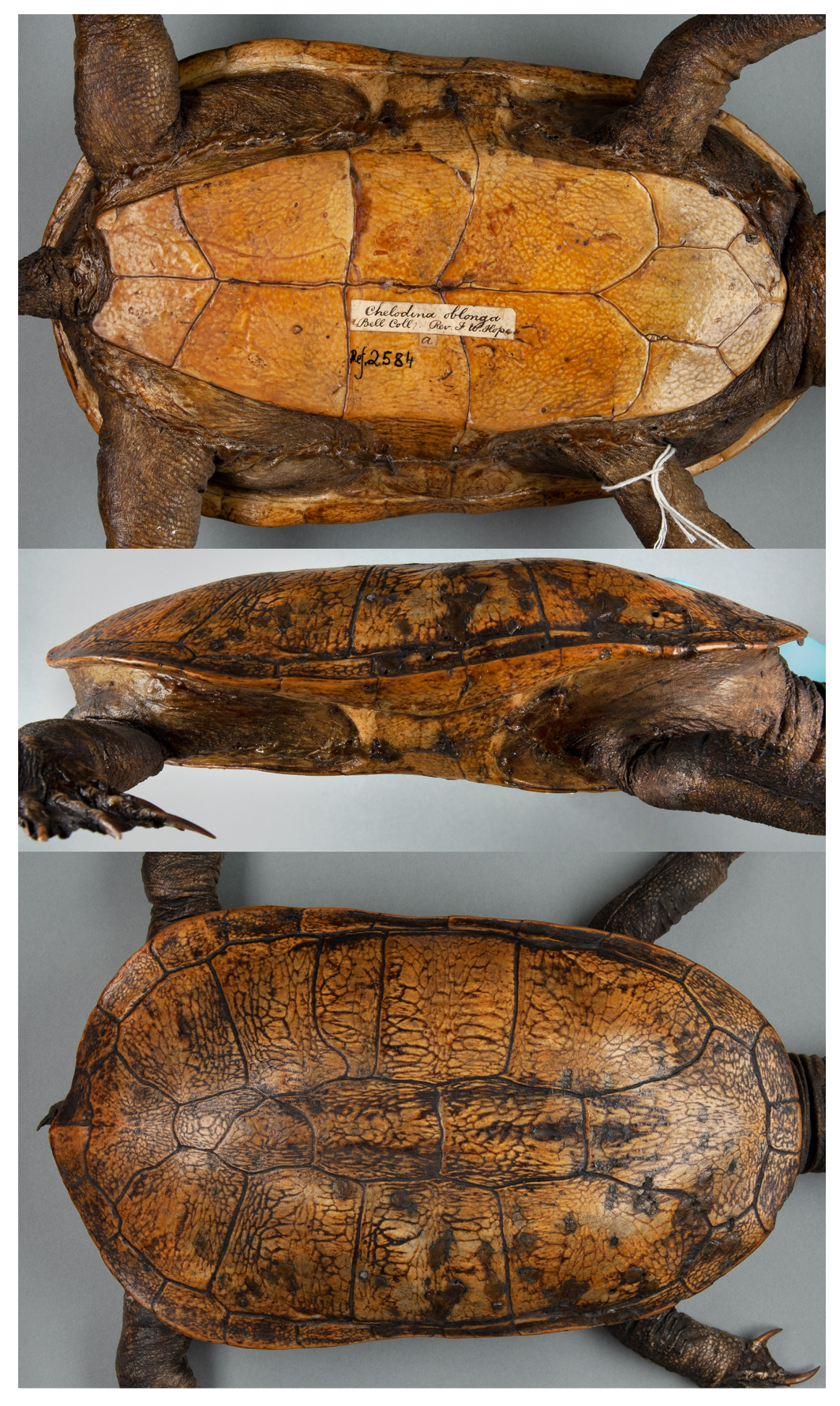
FIGURE 4. Ventral, right lateral and dorsal views of the shell of the paralectotype of Chelodina oblonga Gray (OUMNH 02584). (Images courtesy of K. Child, OUMNH).