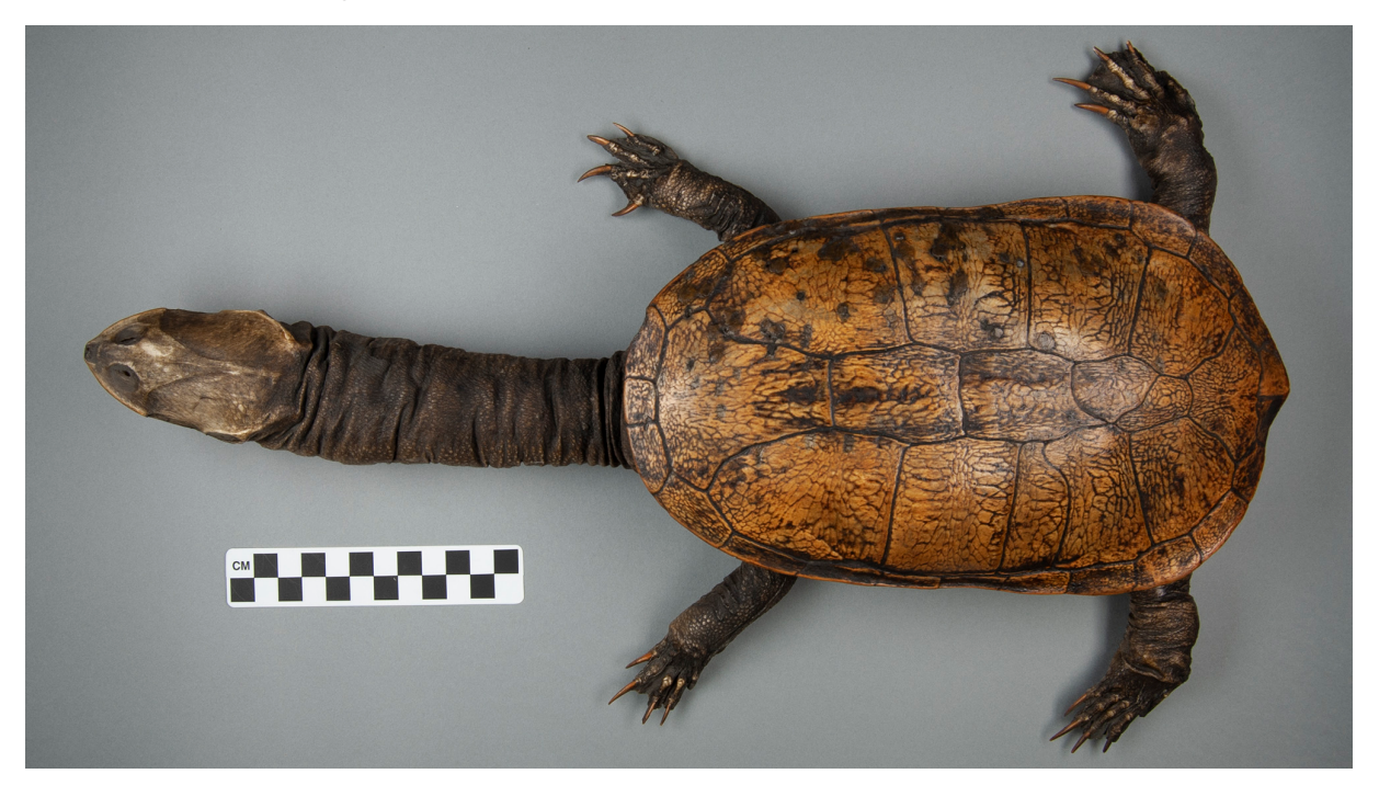
FIGURE 3. Dorsal view of the paralectotype of Chelodina oblonga Gray (OUMNH 02584).