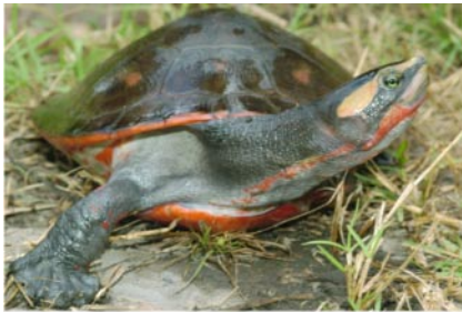
New Guinea painted turtle ( Emydura subglobosa )

dient in traditional Chinese medicine, based on centuries of traditional custom (Jenkins 1995). In Sota, plastra fetch ~10 kina per kilogram. Plastra are retained and traded for this market from as far away as Suki, using established trade avenues for deer antlers, but there was no evidence that this opportunity for trade increased harvest rate except at the Papua New Guinea border communities of Wereave and Weam. Here, nesting E. branderhorsti were heavily harvested during the breeding seasons of 2004 (300 turtles) and 2005 (60 turtles) for their plastra, though the meat was also