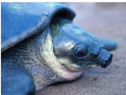
Pig-nosed turtle ( Carettochelys insculpta )