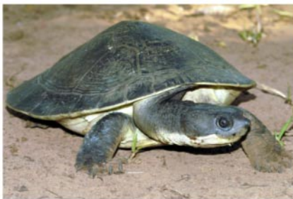
New Guinea snapping turtle ( Elseya branderhorsti )