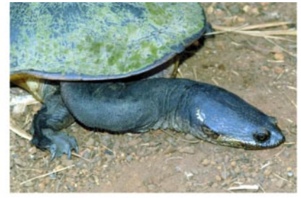
Parker's snake-necked turtle ( Chelodina parkeri )