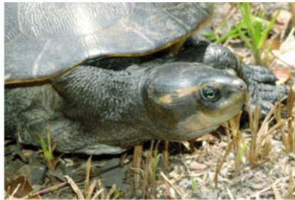
Undescribed/unidentified species ( Emydura sp. possibly worrelli )