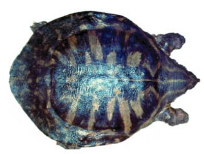
New Guinea giant softshell ( Pelochelys bibroni )