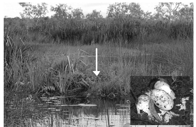
Fig. 4. Typical nesting habitat for Emydura subglobosa in the Suki/Aramba Swamps. In this case, the nest was deposited in moist peat on a floating mat (arrow). The eggs and the substrate in which they were laid are shown as an inset. Photos: 5 September 2005, late dry season.

Exploitation of freshwater turtles in New Guinea is thought to have increased in recent times (Rose et al. 1982; Georges and Rose 1993). More people moved to live along riverbanks as tribal warfare ceased, and the population of Papua New Guinea has doubled since 1971. Modern technologies have improved access, especially the introduction of outboard motors, and modern fishing gear has increased catch rates. In the Western Province, the impact of these factors is greatly moderated by the scarcity and cost of fuel and the lack of fundamental infrastructure to facilitate travel and transport of goods. The Asian turtle trade, feeding new and expanding markets in China, is resulting in often dra-