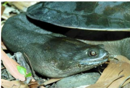
Northern snake-necked turtle ( Chelodina rugosa )