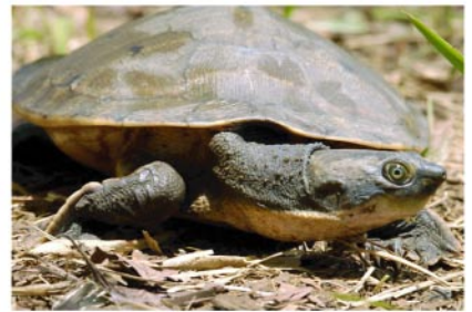
New Guinea spotted turtle ( Elseya novaeguineae )