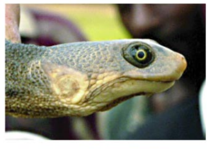
New Guinea snake-necked turtle ( Chelodina novaeguineae )

Fig. 2. Photographs of the nine species of freshwater turtle from the TransFly region. The prominent red colouration of Emydura subglobosa distinguishes it from the undescribed Emydura in which the red colouring is totally lacking. The white patch immediately above and behind the tympanum of Chelodina parkeri distinguishes it from C. rugosa . Note the absence of a cervical scute in Elseya branderhorsti that distinguishes it from Elseya novaeguineae . The Pelochelys bibroni is from Lake Murray, the photograph taken and kindly provided by Anders Rhodin. The photograph of Carettochelys insculpta is a file shot taken on the Daly River, Queensland.