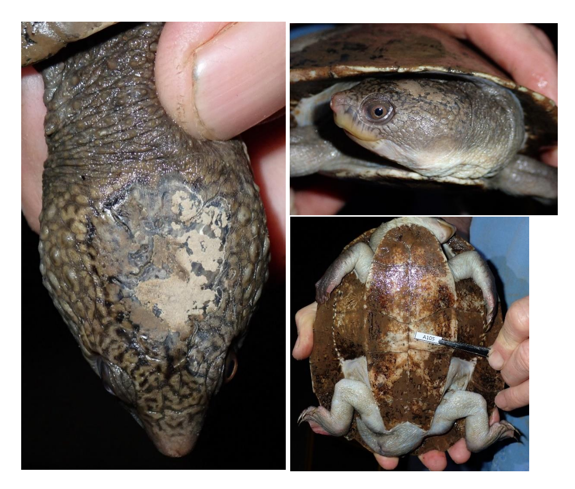
Figure 3. Photographs of Elseya lavarackorum from the Roper River drainage, NT. Note; an intergular scute that only moderately penetrates to separate the humerals, at most half way; low blunt tubercles on the neck, if present, arranged in anteroposterior rows; iris not distinct in life (a character not clearly evident in flash photographs); ramphotheca of upper jaw with vertical streaks, variable in intensity; red flushing on the limbs (fading or absent with age). There are clear differences in the pattern of coloration of the temporal region between Elseya dentata with cream/yellow dots on each temporal tubercle (Figure 2), and Elseya lavarackorum with a reticulated pattern in the temporal and dorsal head regions (depicted here); this fades with age.